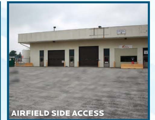
AIRFIELD SIDE ACCESS