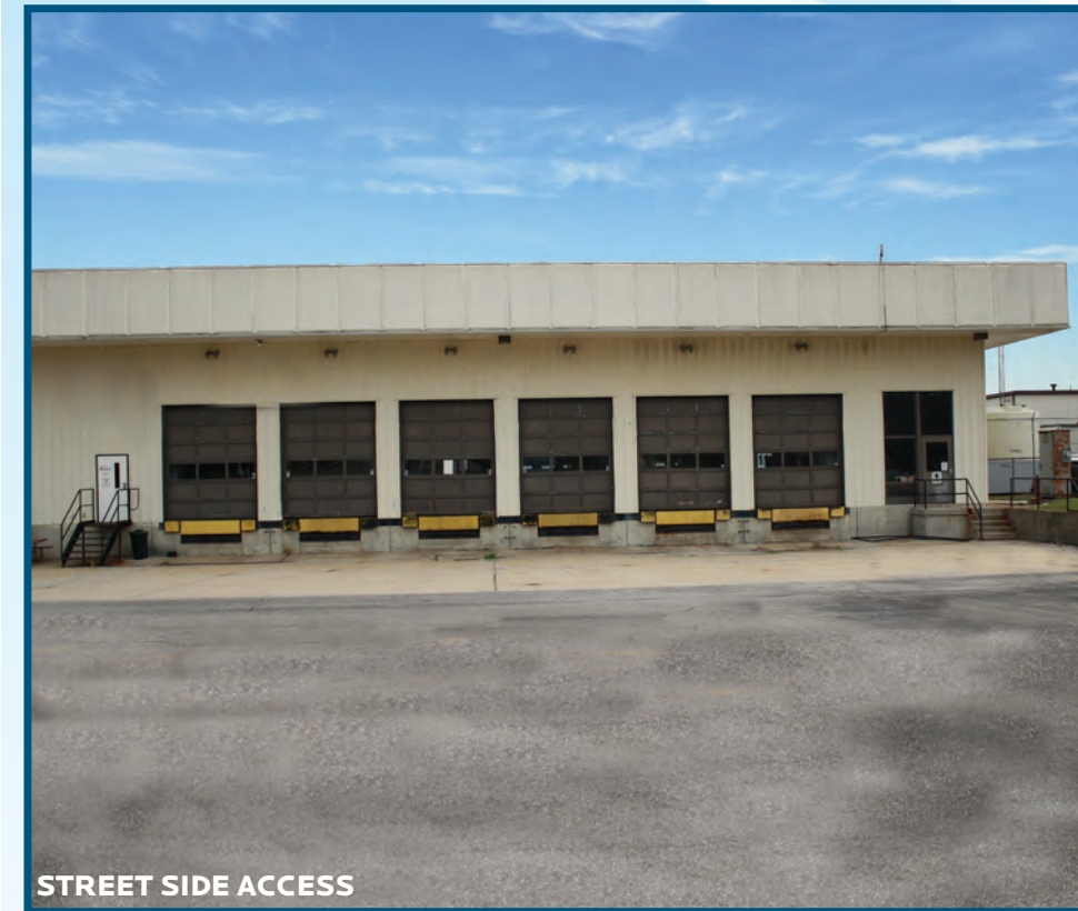
STREET SIDE ACCESS